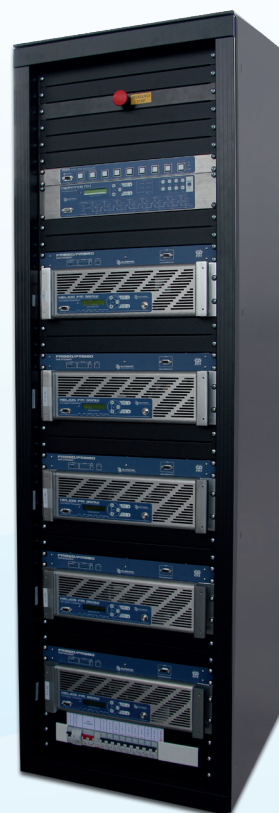
4+1 Ecreso FM 350W