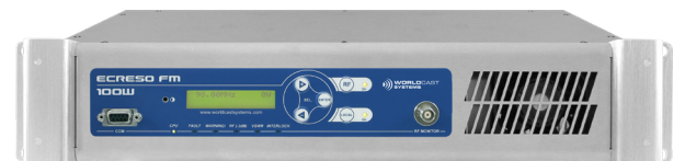
Ecreso FM 100W