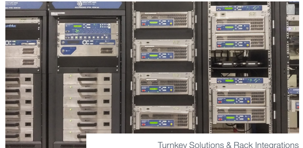
Turnkey Solutions & Rack Integrations