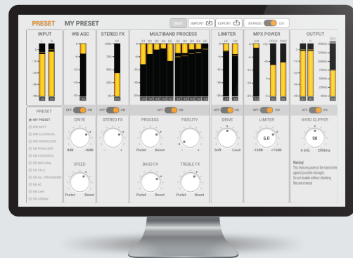
Sound Processor Interface