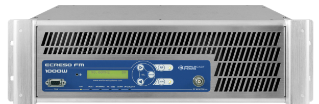
Ecreso FM 1000W