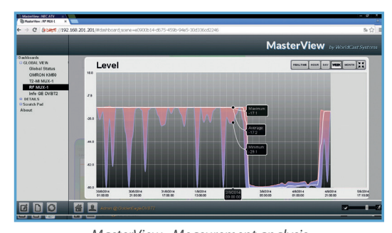
MasterView - Measurement analysis