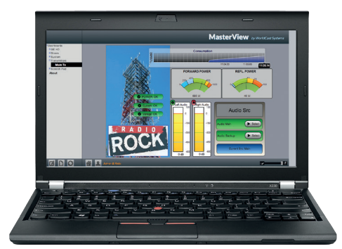
MasterView - Customized view(s)