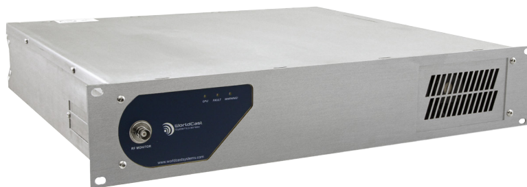
ECRESO Digital Exciter

The Digital Exciter which is at the heart of the ECRESO FM 10kW is based on the design of the well-respected ECRESO FM 100W. Two complete and independent 100W devices work in dual drive mode to offer full redundancy at this stage of the transmitter.