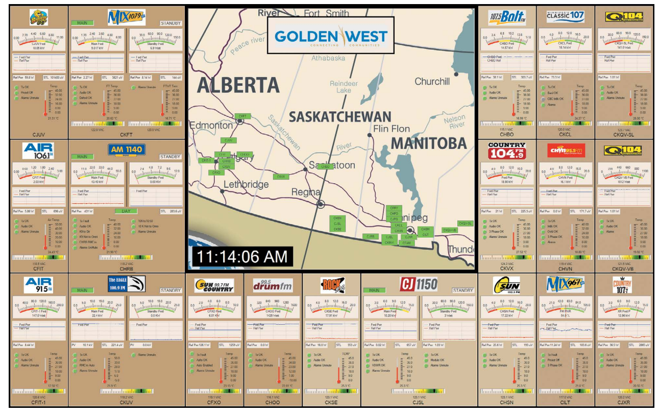
Burk Technology's ARC Plus Touch screen in use at Golden West Broadcasting.

Increasingly SNMP is used for direct, IP-based communication with any device in a system that supports the protocol. A centralized location running AutoPilot can monitor and control multiple ARC Plus or ARC Solo sites. "Our customers use it for network